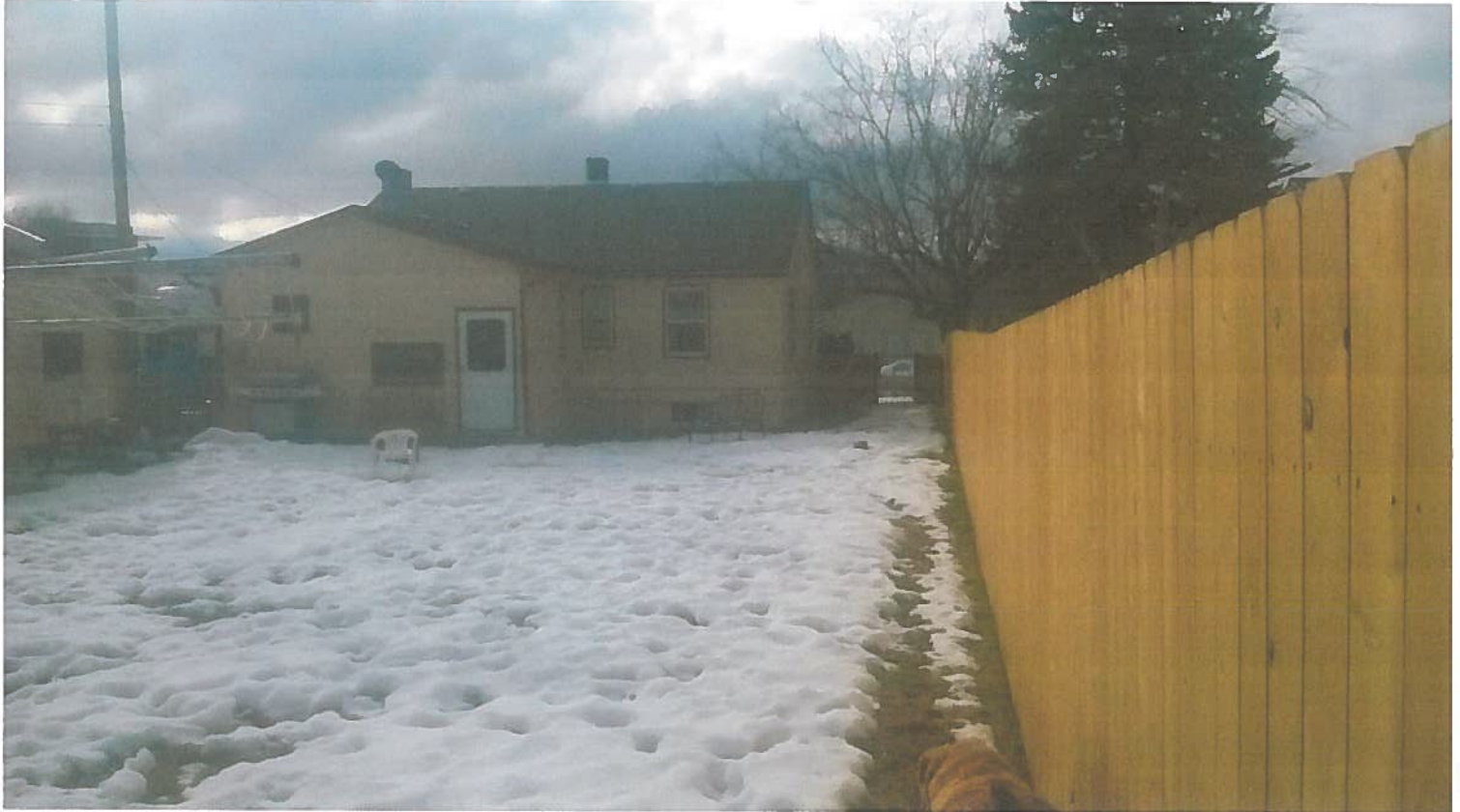
Back (North) side of house

If submitting more photographs than will fit on the preceding page, affix the additional photographs below. Identify all photographs with: date taken; "Front View" and "Rear View"; and, if required, "Right Side View" and "Left Side View." When applicable, photographs must show the foundation with representative examples of the flood openings or vents, as indicated in Section A8.