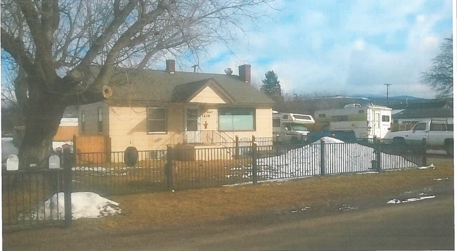
Front (South) side of house

If using the Elevation Certificate to obtain NFIP flood insurance, affix at least 2 building photographs below according to the instructions for Item A6. Identify all photographs with date taken; "Front View" and "Rear View"; and, if required, "Right Side View" and "Left Side View." When applicable, photographs must show the foundation with representative examples of the flood openings or vents, as indicated in Section A8. If submitting more photographs than will fit on this page, use the Continuation Page.