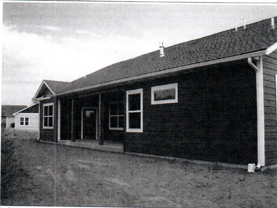
Rear Left View

If submitting more photographs than will fit on the preceding page, affix the additional photographs below. Identify all photographs with: date taken; "Front View" and "Rear View"; and, if required, "Right Side View" and "Left Side View." When applicable, photographs must show the foundation with representative examples of the flood openings or vents, as indicated in Section A8.