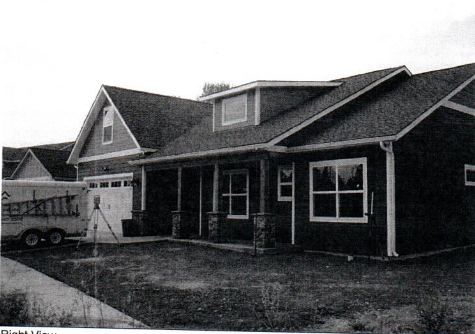
Front Right View

If using the Elevation Certificate to obtain NFIP flood insurance, affix at least 2 building photographs below according to the instructions for Item A6. Identify all photographs with date taken; "Front View" and "Rear View"; and, if required, "Right Side View" and "Left Side View." When applicable, photographs must show the foundation with representative examples of the flood openings or vents, as indicated in Section A8. If submitting more photographs than will fit on this page, use the Continuation Page.