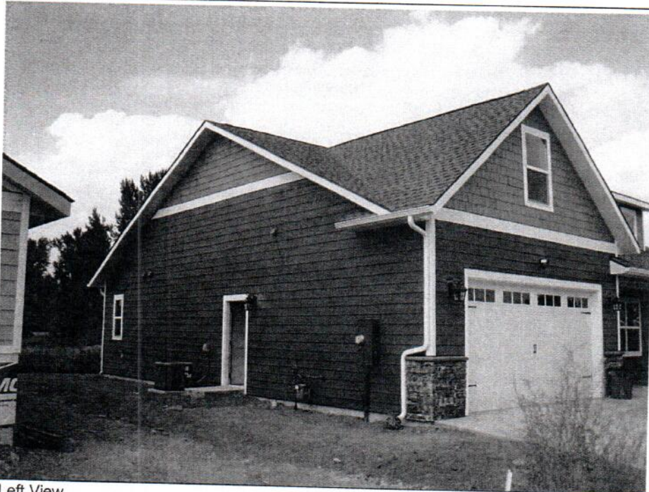
Front Left View